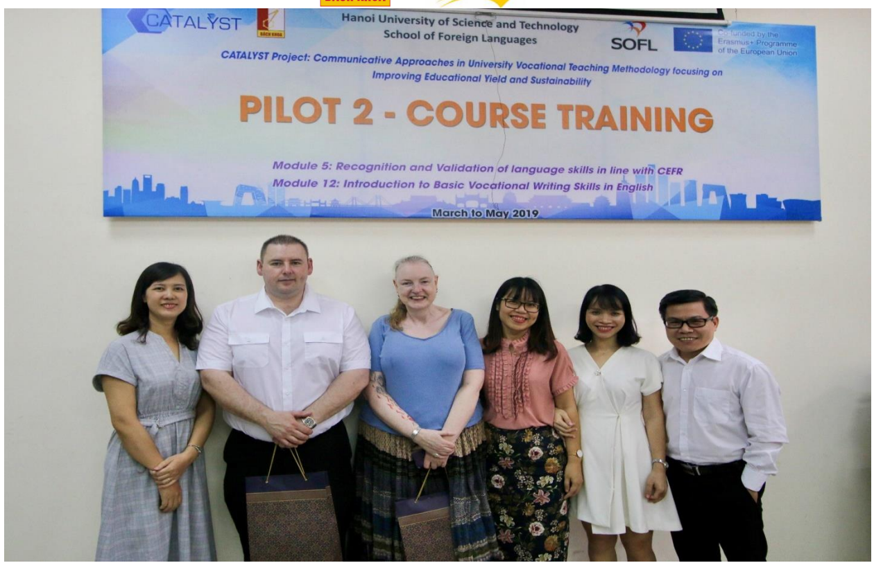
Pilot 2, Module 5 – Recognition and Validation of Language Skills in Line with the Common European Framework of Reference (CEFR) and Module 12 – Introduction to Basic Vocational Writing Skills at the Institute of Foreign Languages – Hanoi University of Science and Technology