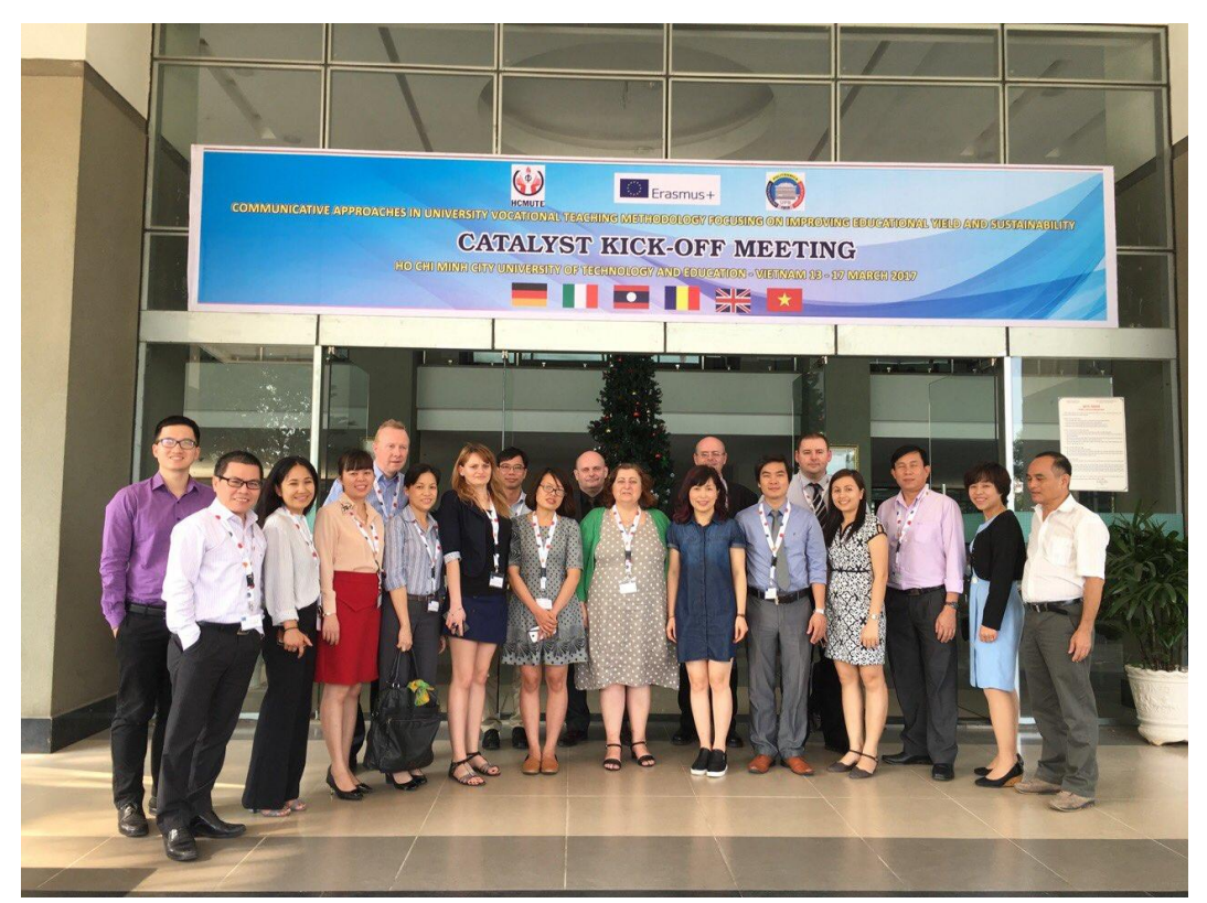
Meeting to prepare for project implementation at HCMC University of Technology and Education