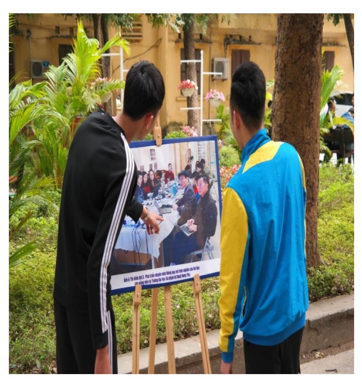
The students arrived early and got ready for learn about the Project activities.

Participants were excited to learn about the project activities and could get a panorama of the project in a convenient way via this National Project Status Awareness Conference Day. Lecturers and students highly appreciated the project piloting sessions and were pleased to have their photograph taken as part of the event.