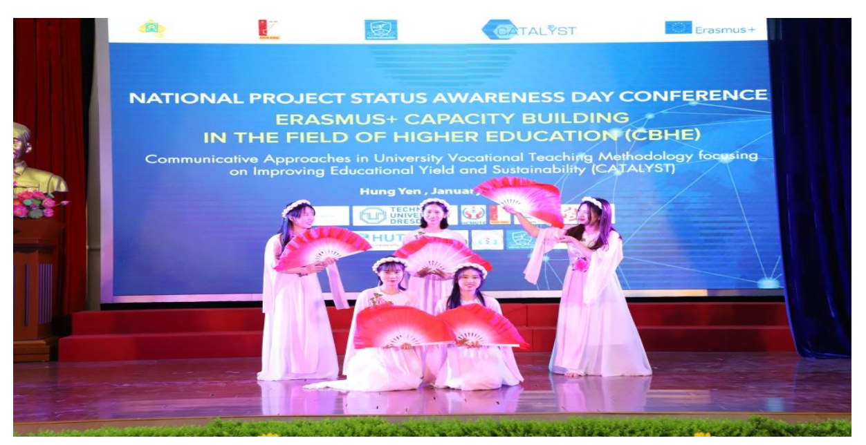
Music performance by UTEHY

The Plenary Session featured a large audience consisting of guests, managers, teachers and students from different institutions (Hung Yen University has 3 campuses: Main campus: Khoai Chau District, Hung Yen Province; My Hao Campus: My Hao Town, Hung Yen Province; Hai Duong Campus: Hai Duong City.