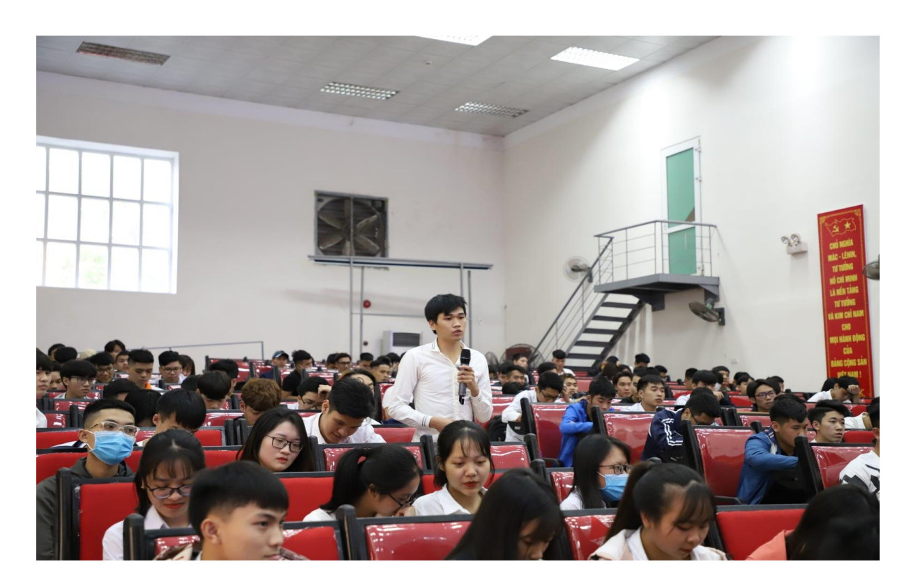
Questions from the audience - A student asks the panel of experts