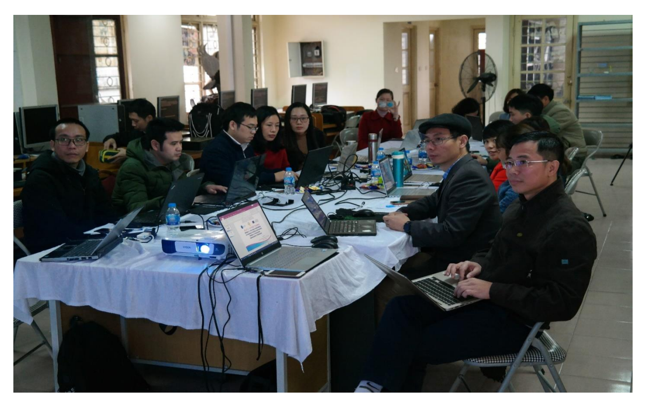
Piloting 3: Professional development through lesson study model for lecturers at Hung Yen University of Technology and Education