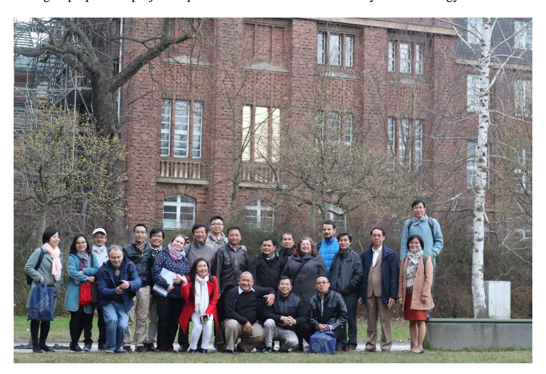
Training for Vietnamese and Laotian project partners at Dresden University of Technology (Germany). The content of the training session focused on communication-oriented teaching methods and unifying the curriculum framework, outlines of the core modules of the project (March 2018).