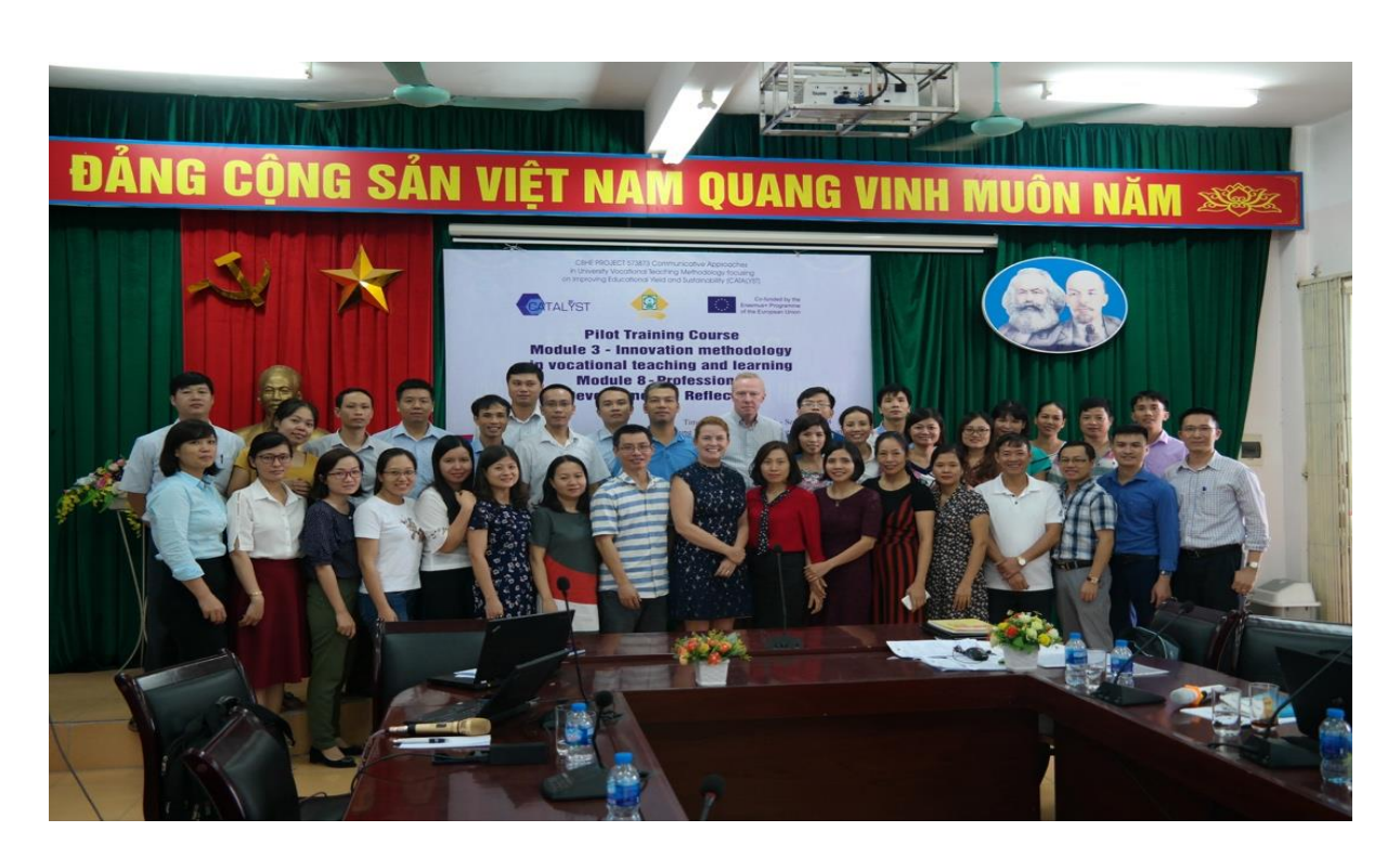
Pilot 3: Module 3 and Module 8 in the Core program at Hung Yen University of Technology and Education

The traditional festival for the CATALYST project and piloting 2 of all 11 modules in the Core Program at the National University of Laos and the Lao University of Health Sciences, with the aim of promoting the application of using communication-oriented teaching methods in vocational and technology education.