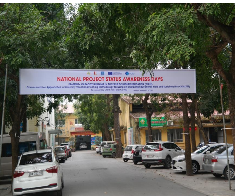
CATALYST Gallery in Campus Khoai Chau – UTEHY