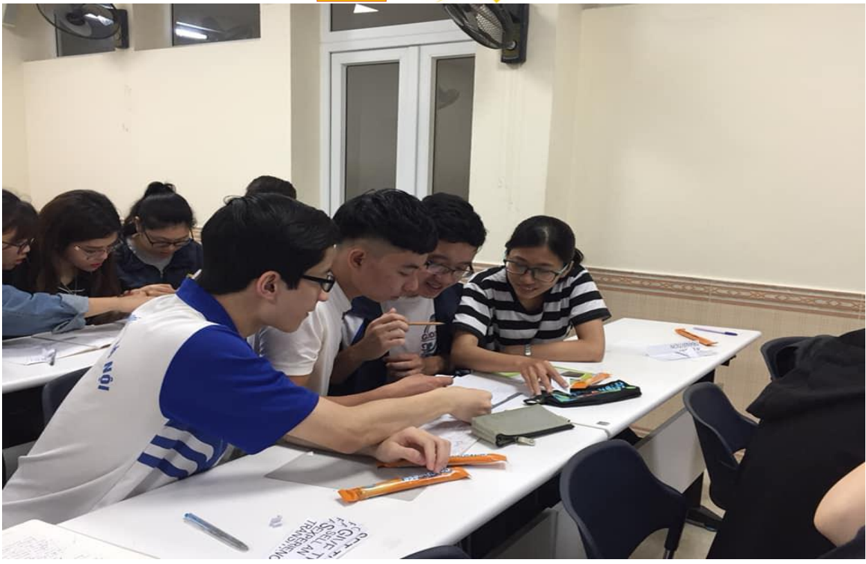
Students participate in group activities during the piloting 3 session at the University of Foreign Languages – Vietnam National University, Hanoi