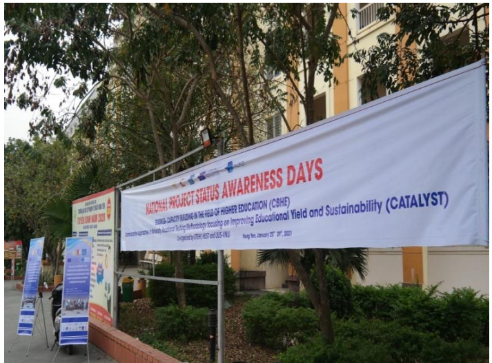
CATALYST Gallery in Campus My Hao - UTEHY

Participants were inspired to observe and be involved in the event and also had the opportunity to watch the 10-minute video introducing the CATALYST Project entitled "The Journey of CATALYST in Northern Vietnam". Many of the participants learned some important facts and figures about the project after joining this NAD activity.