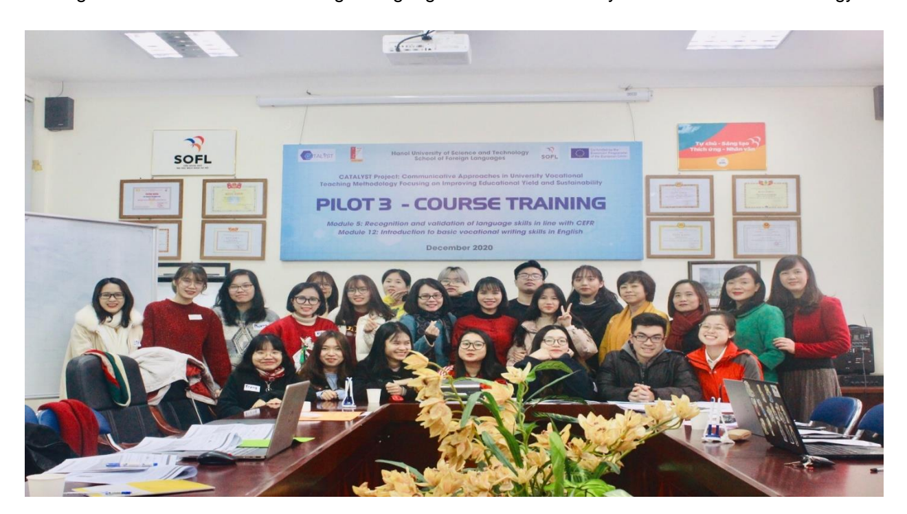
Pilot 3: Training at Hanoi University of Technology