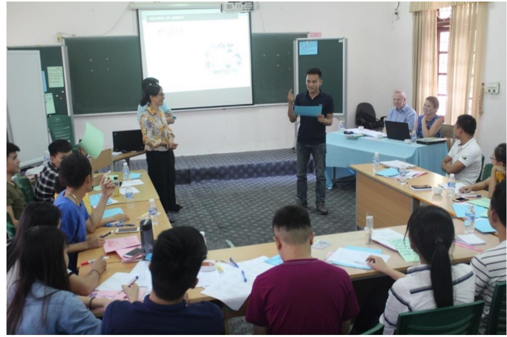
Pilot 1: "Quality Assurance in Vocational Training" at Vinh University of Technology and Education