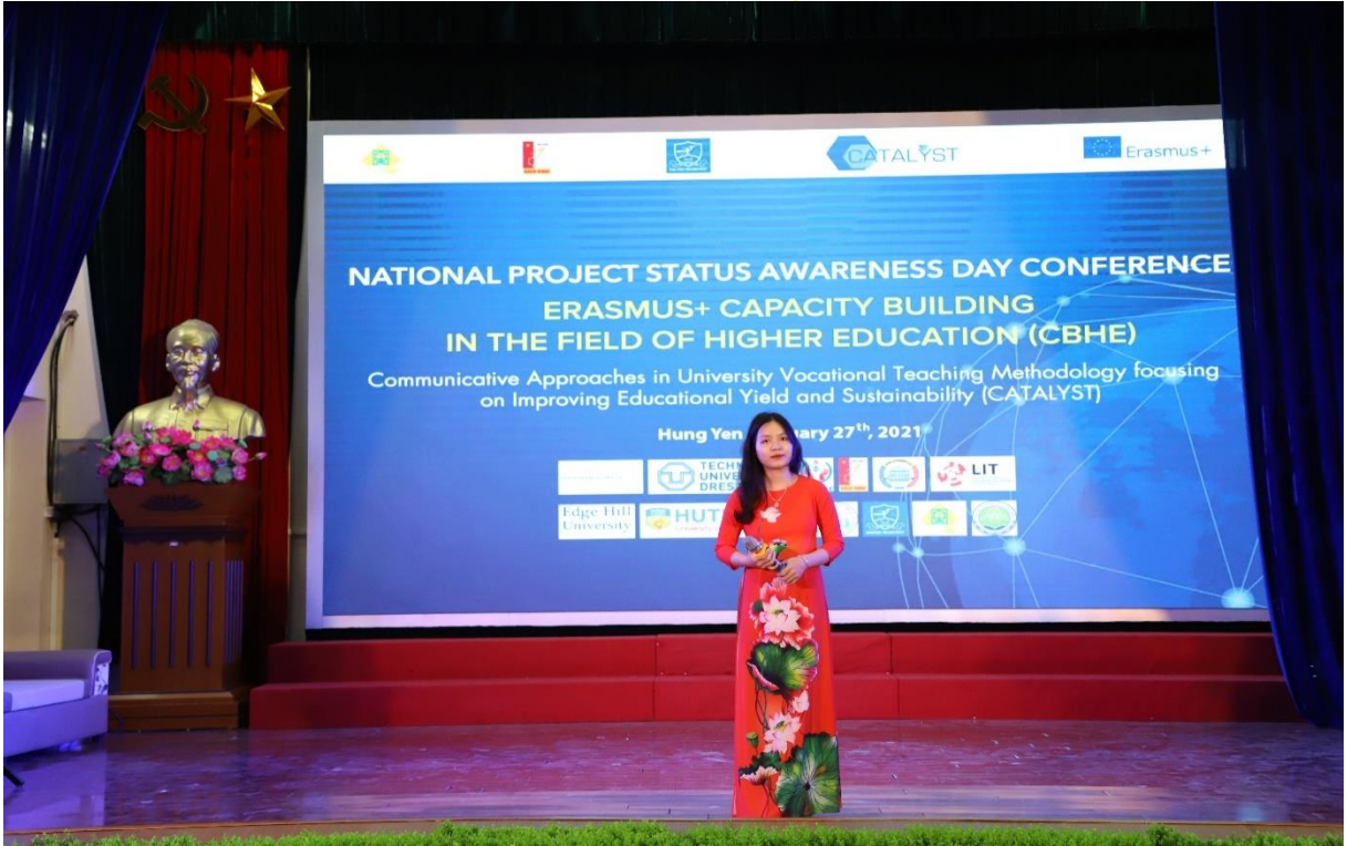
Students from UTEHY with their music performance