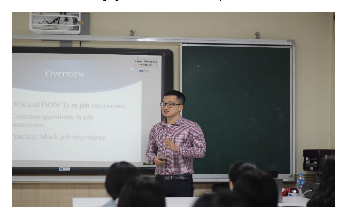
Piloting 2: Lecturer shares skills when participating in job interviews at University of Foreign Languages – Vietnam National University, Hanoi