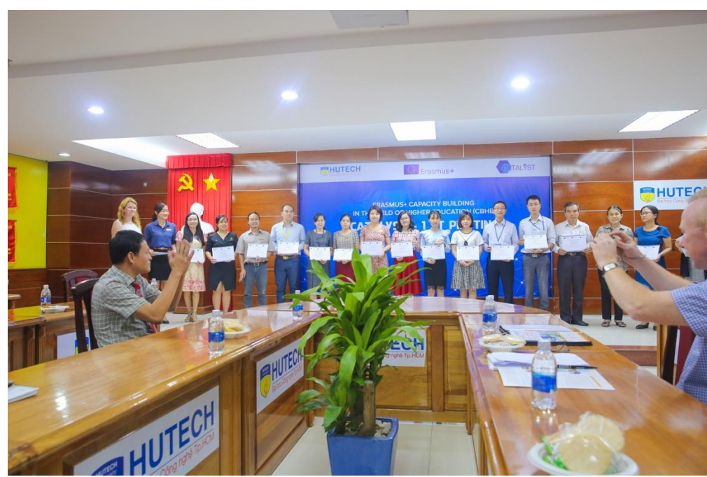
Training in new teaching methods at the International Education Institute – Ho Chi Minh University of Technology (HUTECH)